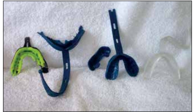
Fig. 4. Collection of OTC MGs found in the course of the study.

the fit is not as comfortable as a custom MG, athletes often chew and abuse them, wedging them in their helmets during down time. This can result in a deterioration in thickness of the posterior occlusal surface over a season of play.