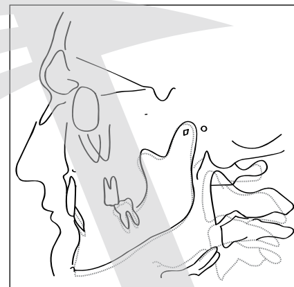
Fig. 1. Overlaying cephalometric tracings showing the changes in head position (upon impact) with and without a 3-4 mm posterior occlusal thickness mouthguard (MG) in position. Note the changes in the head of the condyle, cervical vertebrae, and hyoid bone when an adequate thickness MG was in place (dotted lines) vs normal occlusion (solid lines). (Stenger JM, Lawson EA, Wright JM, Ricketts J. Mouthguards: protection against shock to the head, neck and teeth. J Am Dent Assoc. 1964;69(9):273-281. Copyright © 1964 American Dental Association. All rights reserved. Reproduced with permission.)

Articles by Chapman and McCrory raised questions about the relationship between MGs and the prevention of MTBI/concussion injury issues, but both articles indicated the need for more research on the subject. 7,11 Labella et al found no