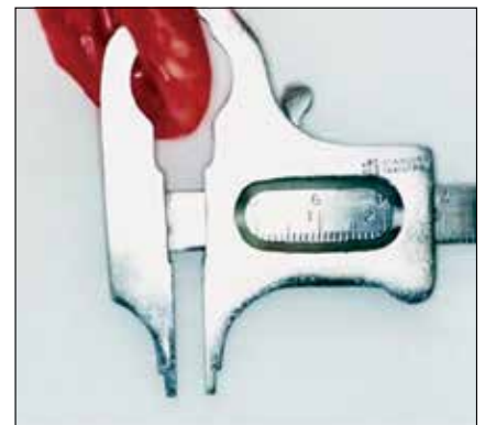
Fig. 6. An example of the caliper used to measure LM MG thickness in the posterior occlusal area at the time of seating.

Certified athletic trainers—members of the National Athletic Trainers Association (NATA)—employed by the high schools were in attendance at all games and practices. Instructions by one of this study's authors (Winters) were given to the players, coaches, and the certified athletic trainers on the proper wearing and care of the LM MGs. Athletes were advised not to chew or wedge the MG in the facemask of their helmet, and not to cut off the posterior occlusal portion of the MG.