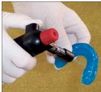
Fig. 5. Flame-warming the LM MG.

High school athletes from 6 football teams in Western Pennsylvania were recruited to participate in this study. Of these, 412 athletes were included in the study. The Institutional Review Board at The University of Pittsburgh Medical Center, Pennsylvania, reviewed and approved the study. Consent was obtained from each player and his parents/guardians. Three teams were randomly assigned to wear the custom LM MG (Fig. 3), and 3 teams wore a standard OTC MG of their individual choosing (Fig. 4). There were a total of 220 and 192 players in each group, respectively. All the players wore the same football helmet (Riddell Revolution, Easton Bell Sports) while in the study. The helmets had been previously provided to the teams for helmet/concussion ImPACT studies. 4