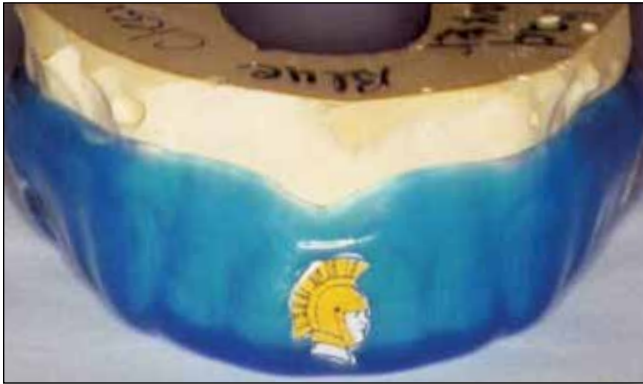
Fig. 3. An example of a custom-made LM MG.